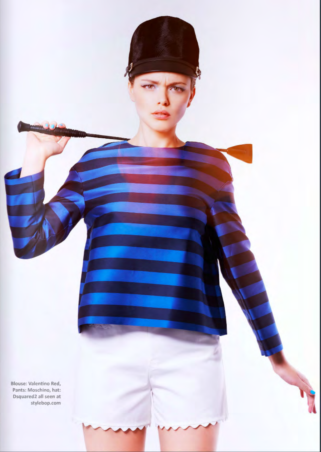
Blouse: Valentino Red, Pants: Moschino, hat: Dsquared2 all seen at stylebop.com