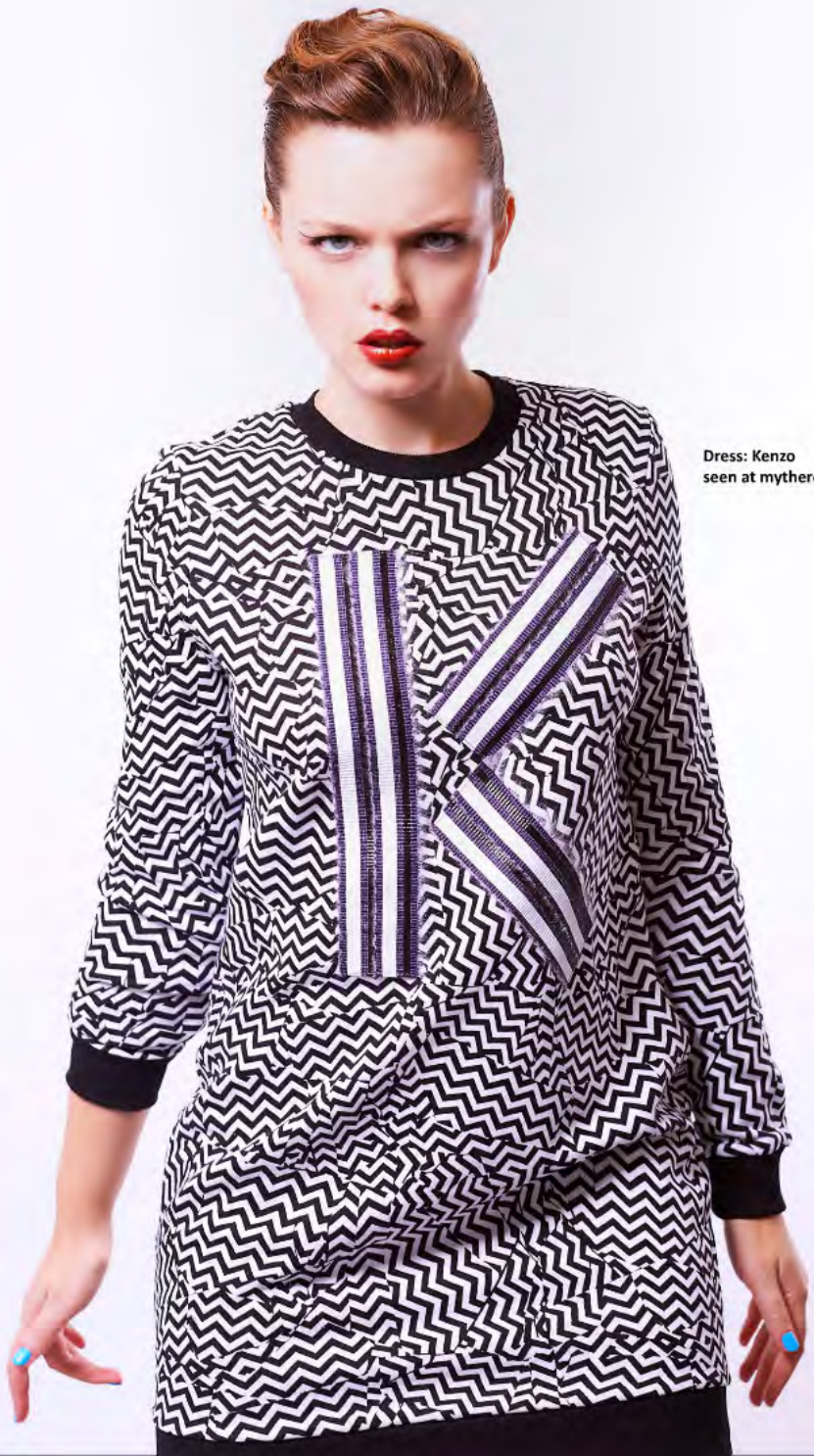
Dress: Kenzo seen at mytheresa.com