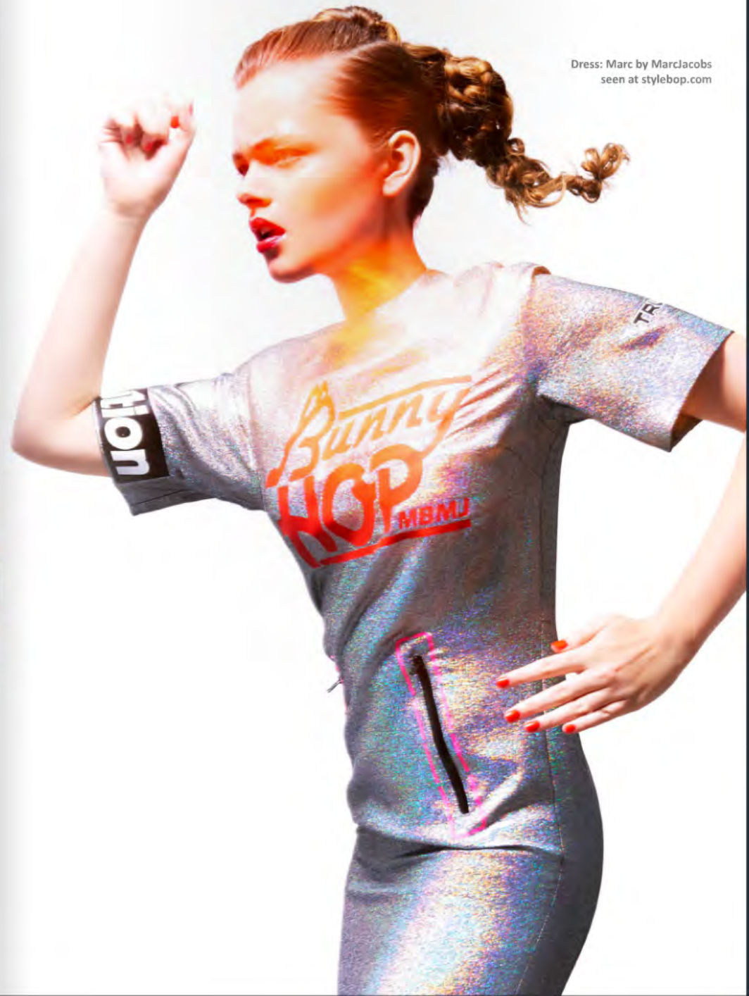
Dress: Marc by Marc Jacobs seen at stylebop.com